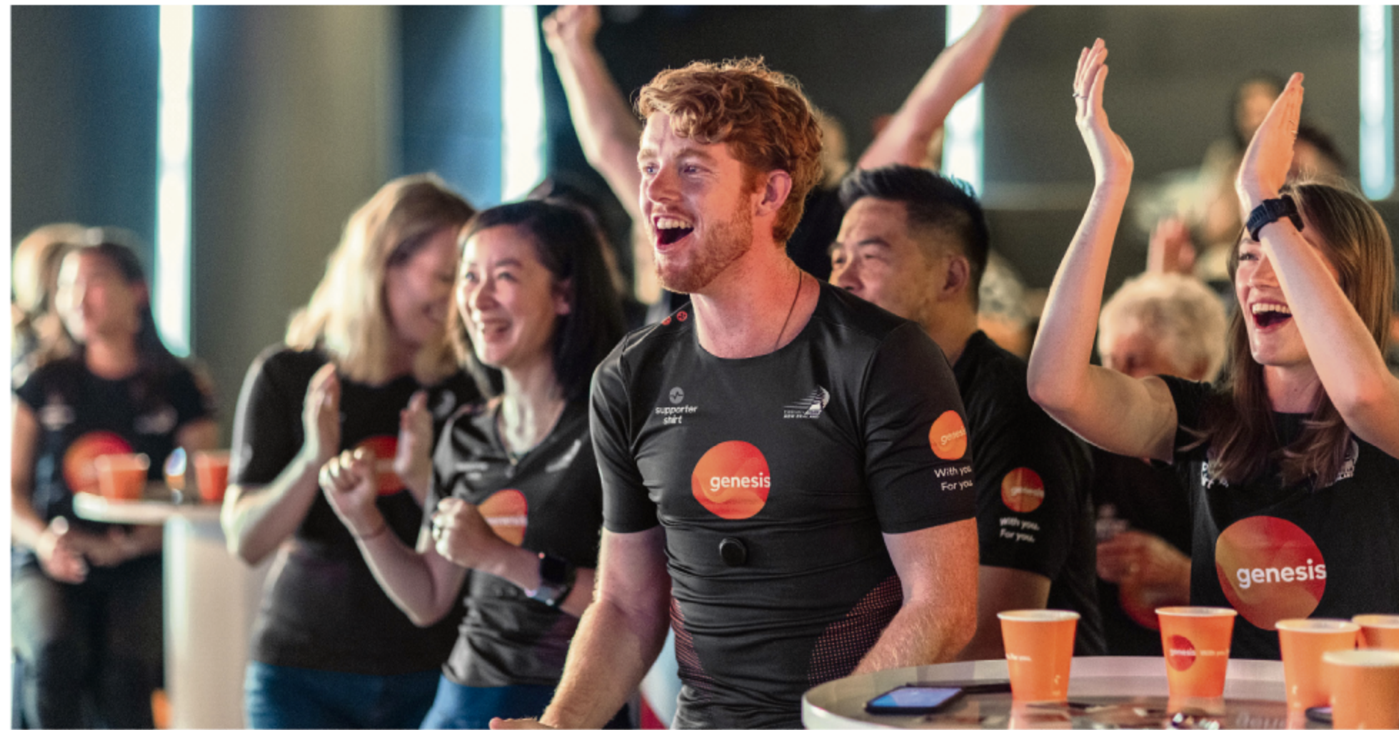
Emirates Team New Zealand fans wear Genesis Supporter Shirts to create free power for Kiwi Schools.

More than 185,000 hours of free power has been donated to Genesis-powered schools across the country in the last month, thanks to Genesis and the energy generated by Emirates Team New Zealand's biggest supporters.